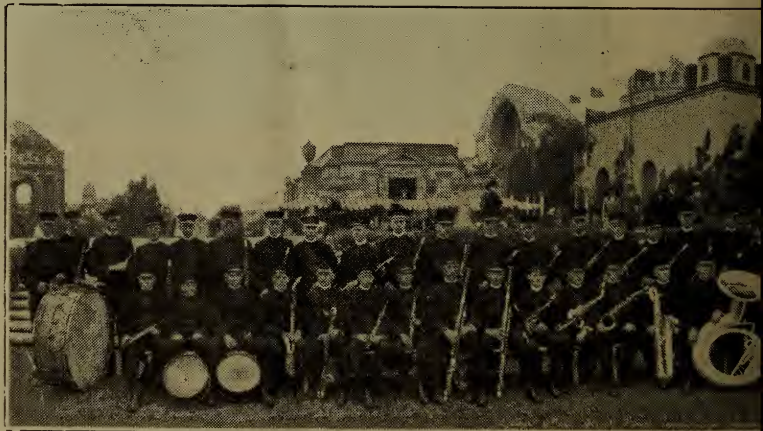
The Concert Band at t